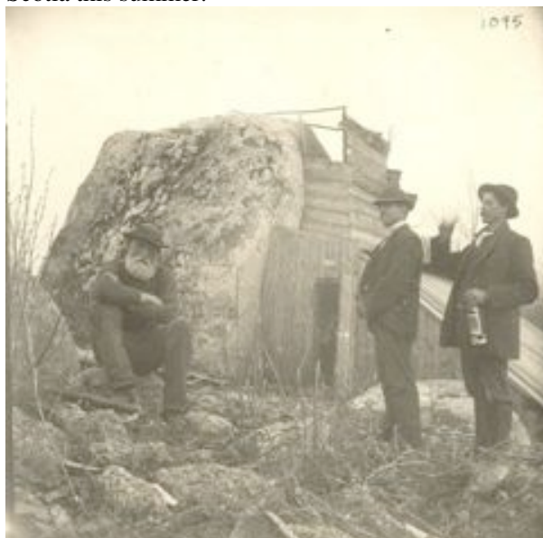
Backwoods guides will play an important role in The Tent Dwellers exhibit at the O'Dell House Museum this summer. This image, taken circa 1895 comes from the AHS's Harris collection

Finally, 2008 is also the 225 th anniversary of the arrival of the Loyalists in Annapolis County. Using the stories of several local families, we are building an exhibit which will look at various aspects of the Loyalist experience. Far from being the simply the upper crust of colonial American society, the Loyalists represented all facets of that society. This is a group who quite literally included everyone from slaves to aristocrats. Our exhibit will use artifacts and images to tell the stories of how the Loyalists came to settle in Annapolis County and who these people were. Additionally, this exhibit is a part of numerous Loyalist themed activities which will be taking place throughout Nova Scotia this summer.