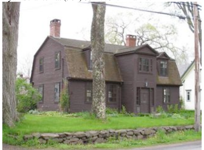
The 300 th anniversary of the deGannes-Cosby House on St George Street in Annapolis Royal has inspired the Heritage Builder's Ball.