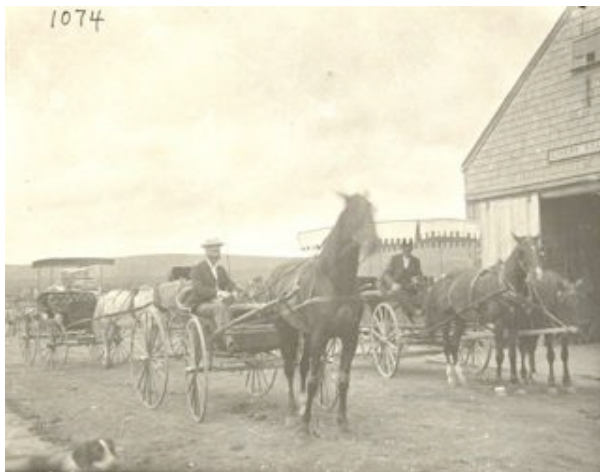
An image from the AHS's Harris Collection. This photograph was taken circa 1900.